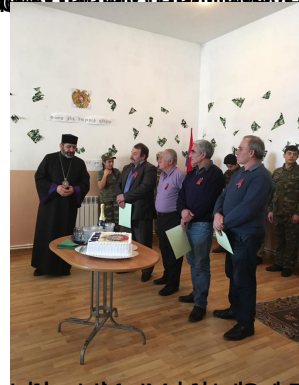
Members of the parish and military personnel gathered for the children's day