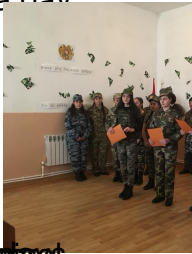
Children of the parish in military uniforms holding gifts