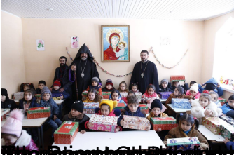
Children of the parish holding gifts received for the children's day